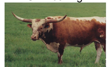
CP Ace High