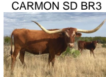
CARMON SD BR3